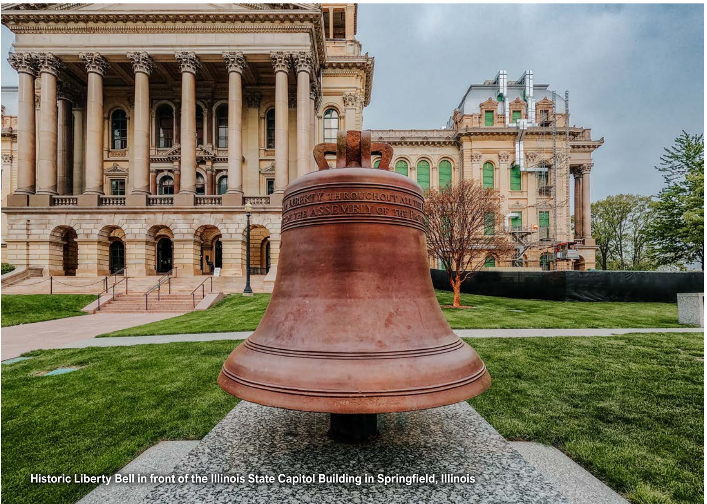
Historic Liberty Bell in front of the Illinois State Capitol Building in Springfield, Illinois

For assistance call the BidBuy Helpdesk at (866) 455-2897 or via email at il.bidbuy@illinois.gov