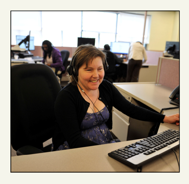
A visually-impaired employee from the Chicago Lighthouse in Chicago takes a I Pass call at a Call Center for the Tollway.