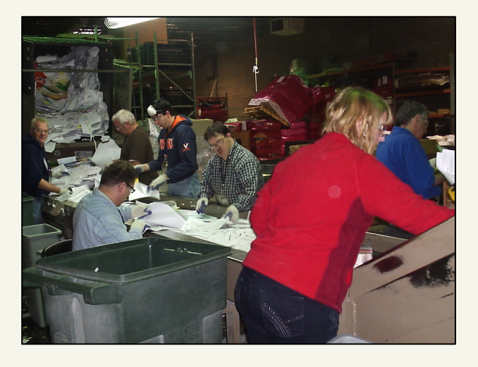
Disabled citizen from Secure Data Destruction in Northbrook sort paper products as the paper comes down the sort line.